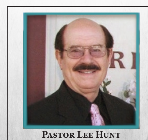
SERMON NOTES FOR